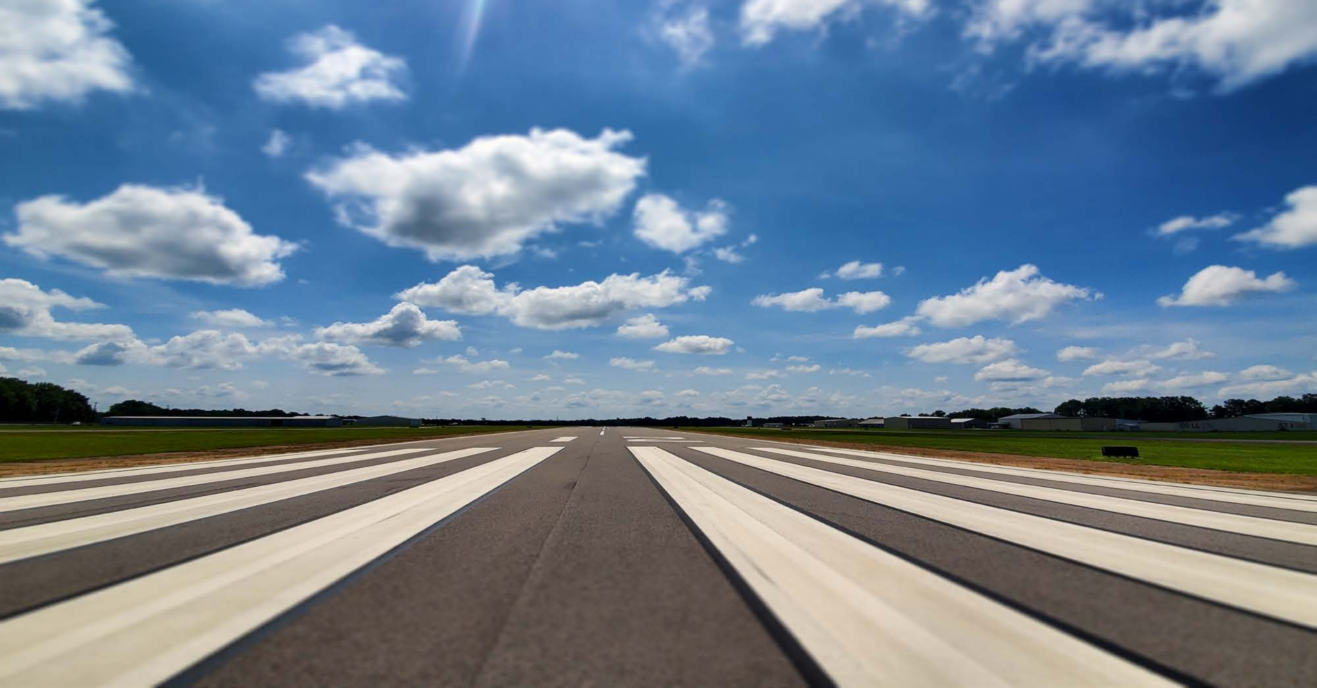
Tuscaloosa National Airport (TCL)