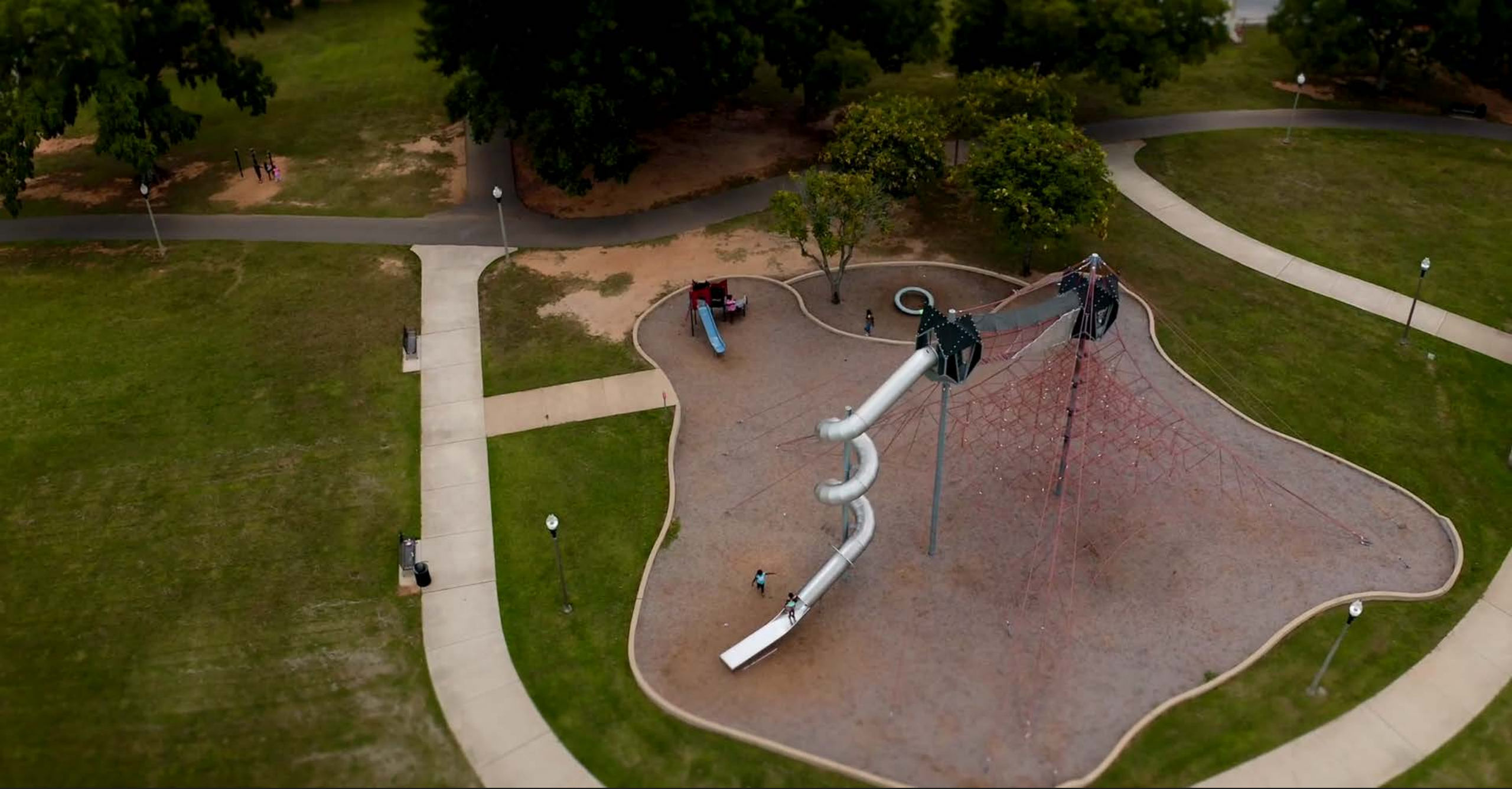
Snow Hinton Park