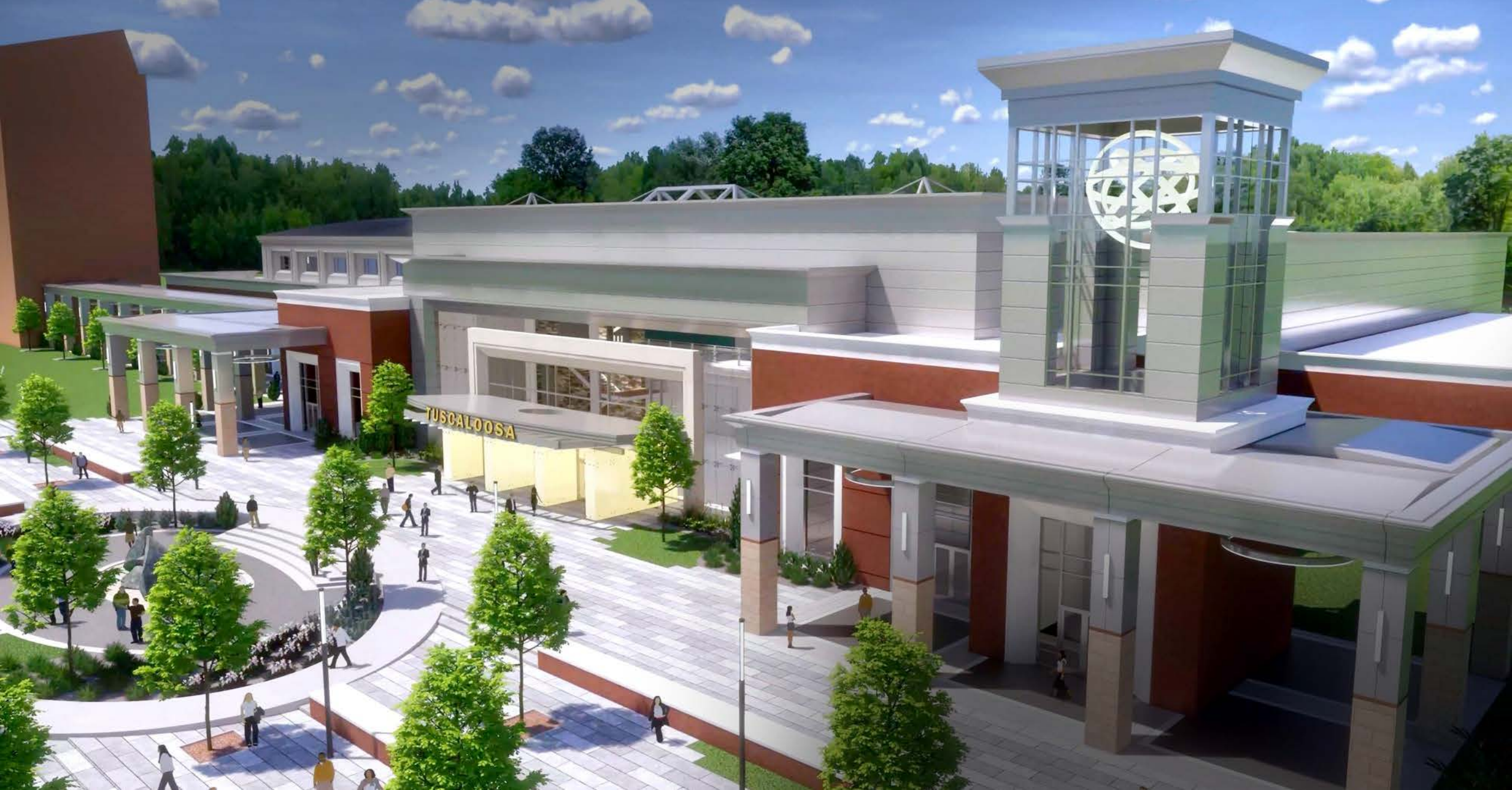
Conference Center Concept