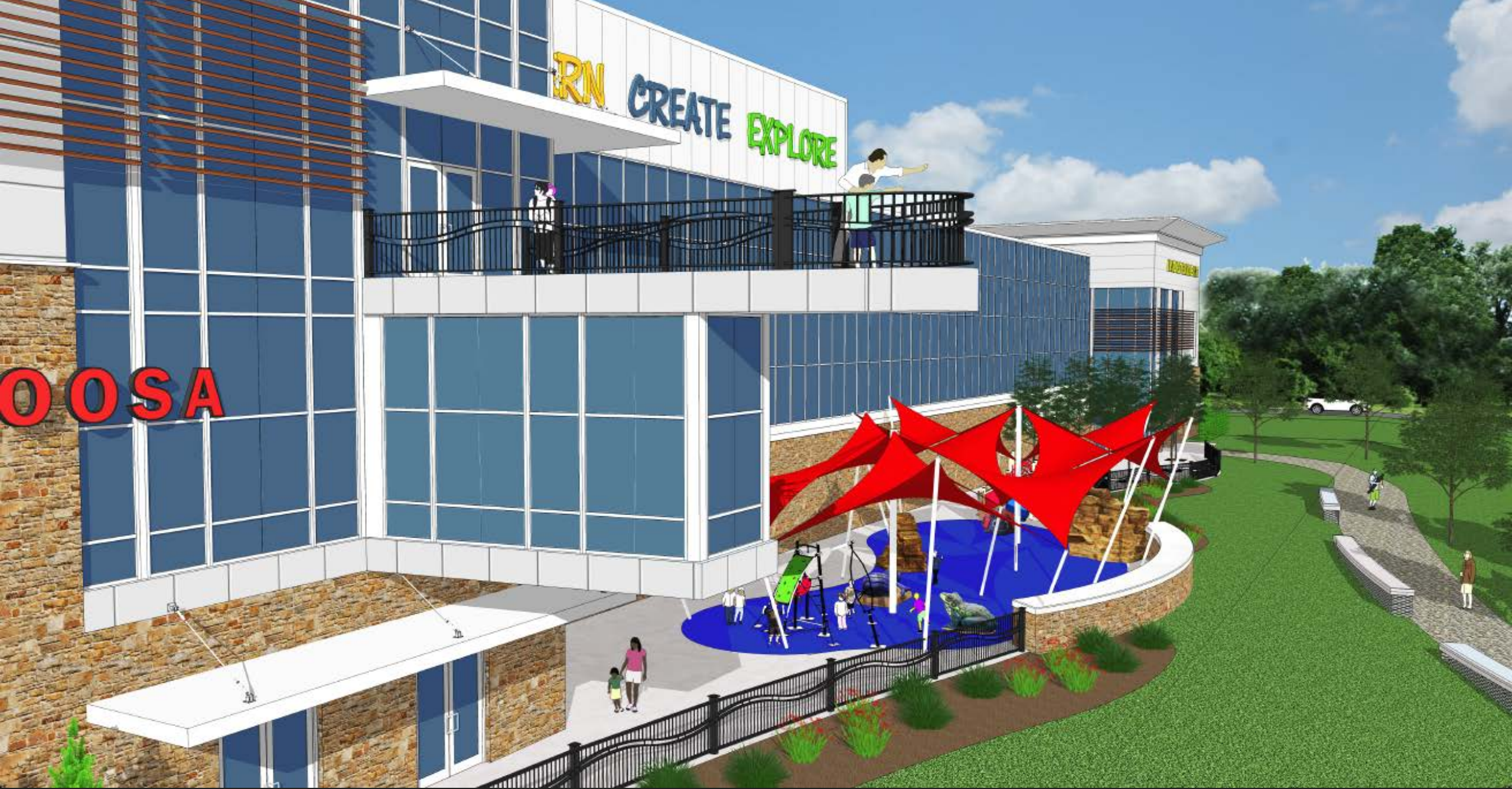
Concept Rendering – North Elevation (detail)