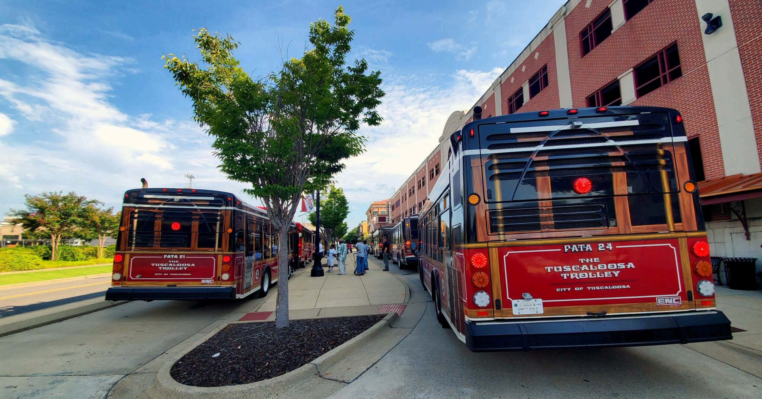
Parking and Transit Authority (PATA)