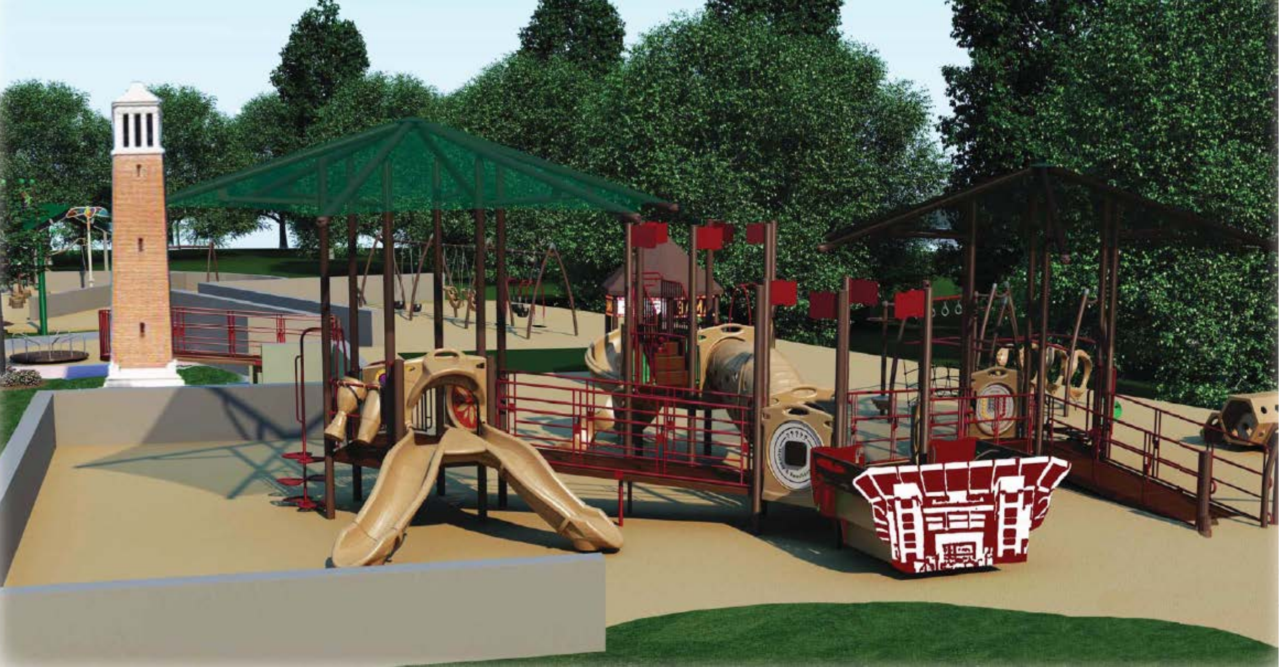
All-Inclusive Playground at Sokol Park