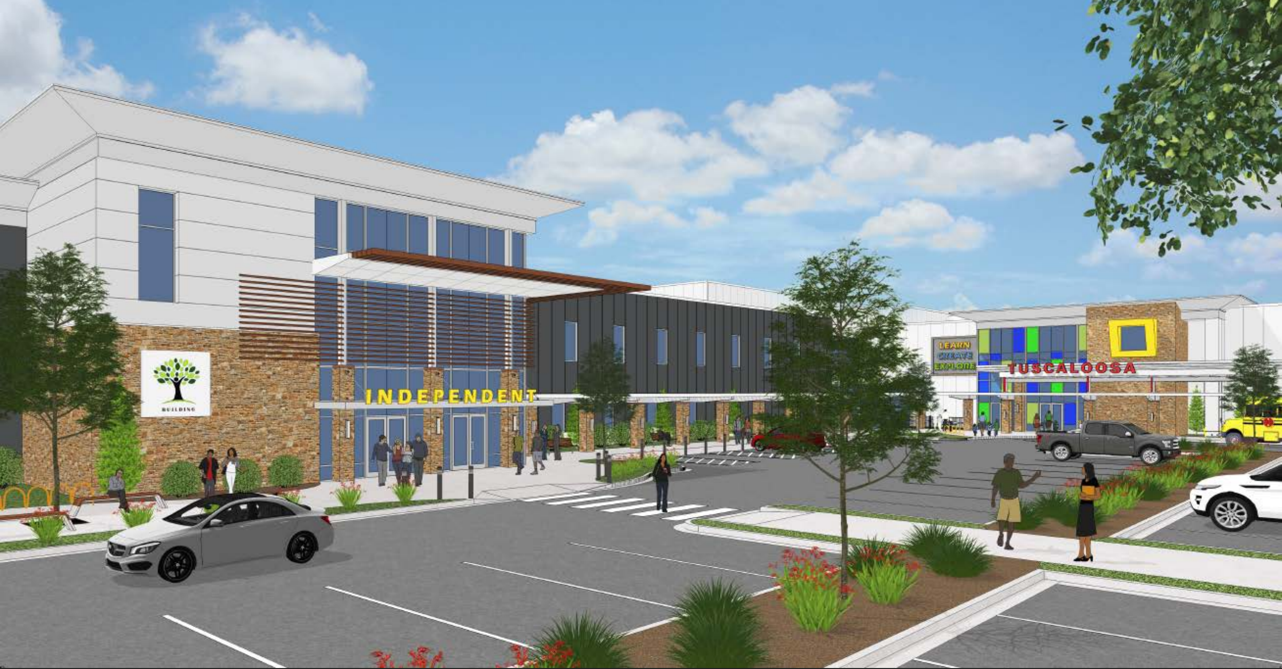
Concept Rendering – South Elevation