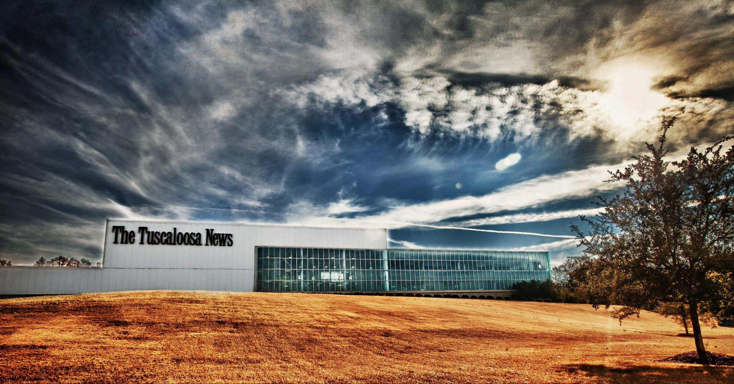
Tuscaloosa News Site – 315 28 th Avenue