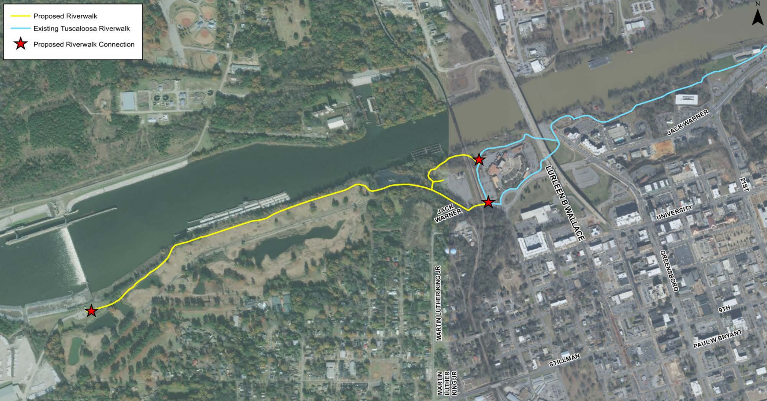
Proposed Western Extension (2018 Riverwalk Master Plan Update)