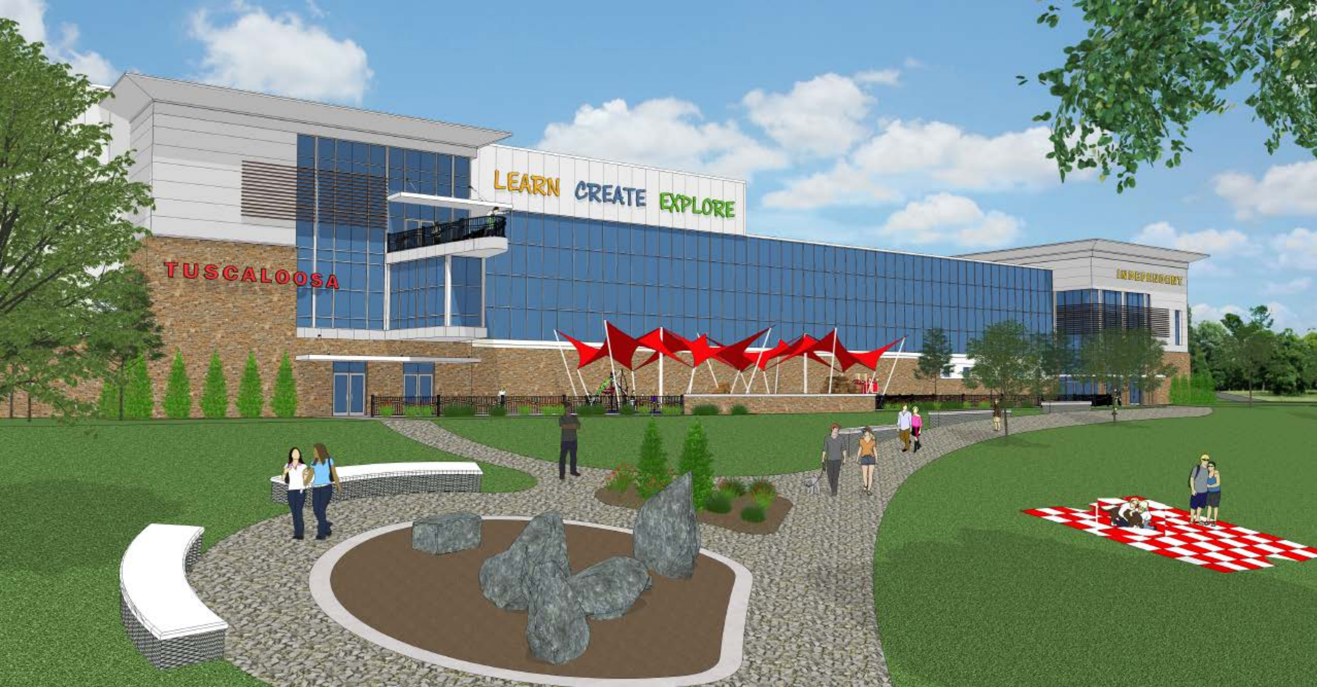
Concept Rendering – North Elevation