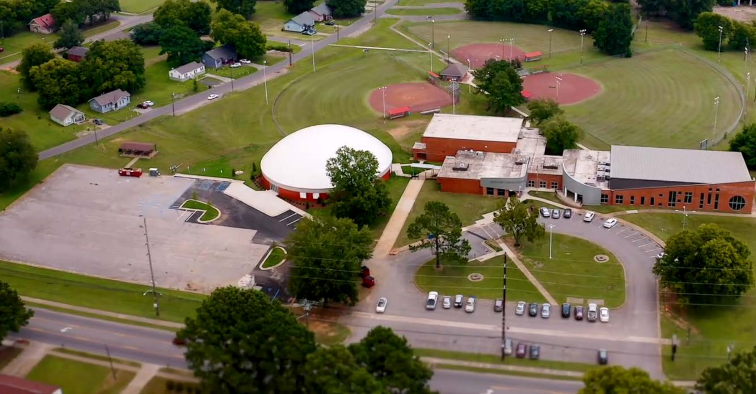
McDonald Hughes Community Center